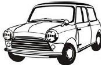
All entrants must supply a 3/4 view photo of their vehicle.

13. All entrants must supply a photograph of their vehicle with their entry form (a three-quarter view from the front like the example below is preferred). This must be of the vehicle as it will be presented on the day of the event. Additional photographs may be requested for scrutineering purposes.